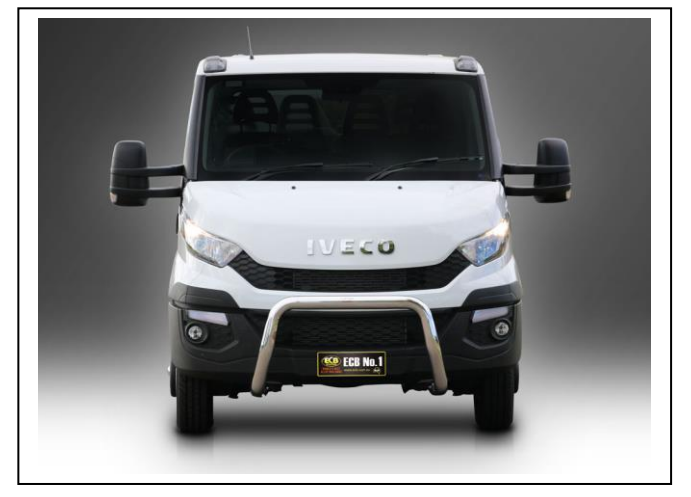
Figure 5 – Front view shown