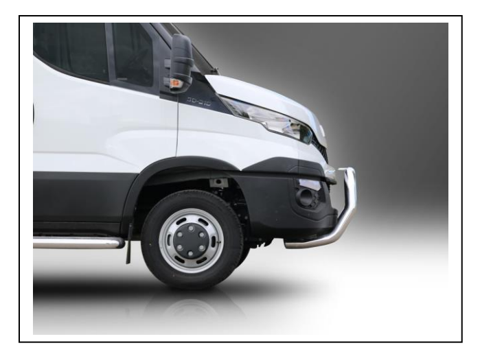
Figure 4 – Side view shown